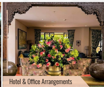
Hotel & Office Arrangements