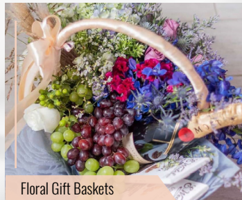
Floral Gift Baskets