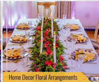
Home Decor Floral Arrangements